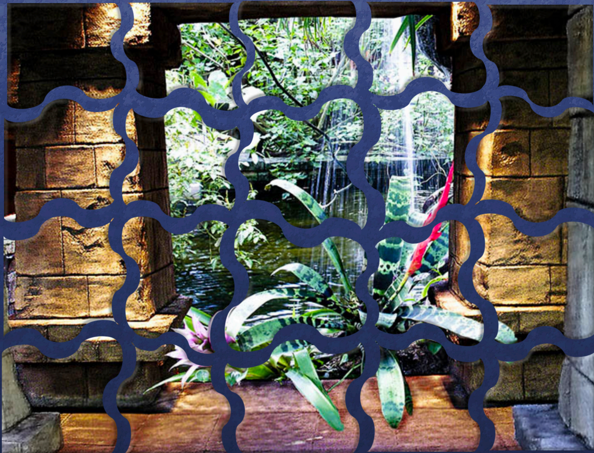
Tropical Pool from Mayan Jungle Adventure